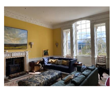
Asknish House Built Heritage