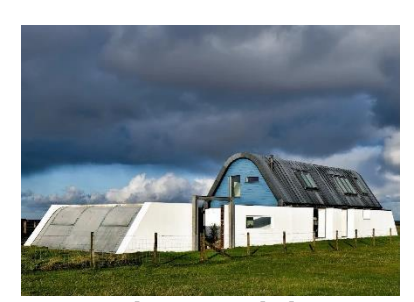
Taigh an Ailtire Aesthetic Design (Small Scale) Winner