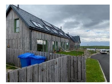
Lochend Sustainable Design Award