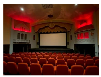
Campbeltown Picture House Members Vote