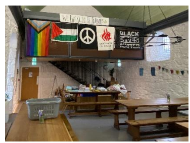
Iona Abbey Public Vote

7.2 Sustainable Design Awards: Submissions for the Argyll and Bute Sustainable Design Awards came in from all corners of the council area. Site visits were inspirational – showing the extent to which architects and clients, have been willing to use innovative techniques, diverse materials, along with healthy ingenuity to deliver ambitious projects. They also showcased the flexibility of the planning team in responding to unique applications, and working with developers to achieve results that enhance our communities. I was delighted to be present as the winners were announced last week and hope that these are inspirational for reflecting heritage and the landscape in future developments. You can see submissions below: