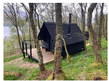
Charcoal Huts Under £100k