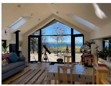
Eilean da Mhèinn Aesthetic Design (Small Scale) Commended