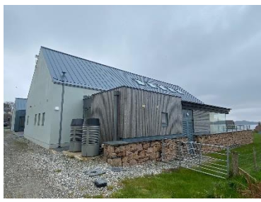
Iona Village Hall Aesthetic Design (Large Scale) Winner