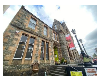
The Burgh Hall Community Regeneration Award – Commended